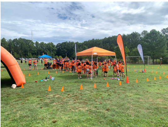
Apex Leadership Fun Run 2023